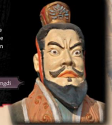
statue of Qin Shi Huangdi

Qin Shi Huangdi, the first emperor of China, was also known as Ying Zheng. He was only 13 when he became king of the state of Qin. At age 22 he led his army to victory over nine other states. His royal name, Qin Shi Huangdi, means "the first emperor of the Qin Dynasty."